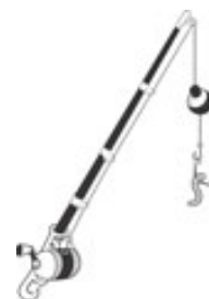
RODS & REELS