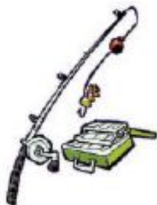
NEW & USED FISHING TACKLE