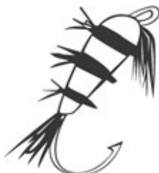
FRESH & SALT WATER GEAR